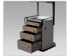
Full extension Drawers