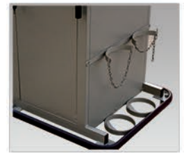
Dual Oxygen Cylinder Holders