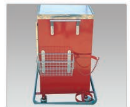
Cylinder holder and utility basket